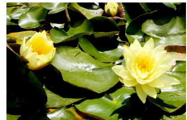
Beautiful yellow water lilies greet us

It is nigh on impossible to accurately comprehend all of the wonderful amenities of our “Water World” we call Seabridge Village ...especially from the ground. There are so many lakes and streams all inter-connecting throughout the complex interlaced with a woody feel created by thousands of trees of all types and a vast multitude of shrubs, plants and flowers. And, added to all this is wildlife: raccoons, possums, hawks, doves, crows, squirrels, koi fish, egrets, herons, ducks, frogs, coyotes, and more! It’s hard to believe that we are living in the middle of a city.