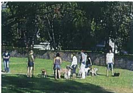
Pooch owners can enjoy warm fellowship in our "Central Park"...just be mindful that many kids are at play

It truly pays for each of us to pause frequently and take in the vastness of our heavenly environs we choose to enjoy: the woody ambience combined with thousands of trees and shrubs, flowering plants, spacious parks, four swimming pools, tennis courts, streams and beautiful lakes and wildlife...all of which require on-going servicing and maintenance. Make the time to enjoy it all.