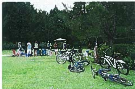
Our parks are great for picnics!

Waterfalls abound everywhere providing soothing sounds to quiet the rattled nerves at day's end. Enjoy!