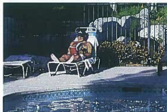
Quiet time around the pool is one highlight ending a perfect day!