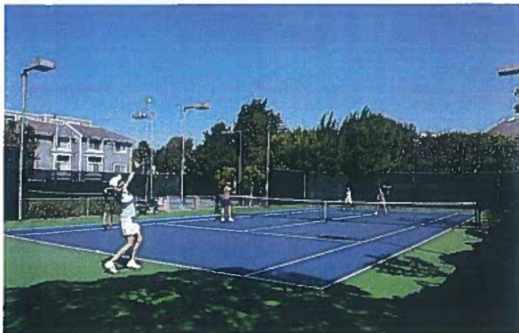
Our four newly renovated tennis courts are now complete, including new wind screens!